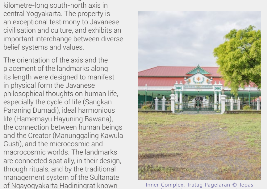
Inner Complex. Tratag Pagelaran

The attributes of the property have been identified and include both tangible and intangible aspects. The latter include cultural heritage practices relating to the cycle of life (birth, marriage and death), venerating ancestors, coronations, funerals, Islamic days, the connection of the natural, macrocosmic and microcosmic worlds, and day to day offerings.