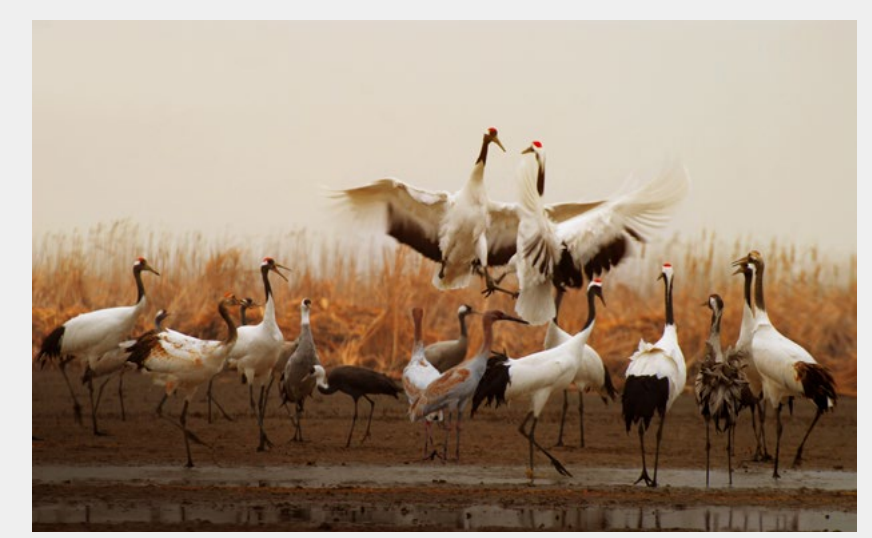
Grus japonensis

The two component parts of the property are both located on the coast of the Yellow Sea in Jiangsu Province. Jointly, the Migratory Bird Habitat in the South of Yancheng, Jiangsu and the Migratory Bird Habitat in the